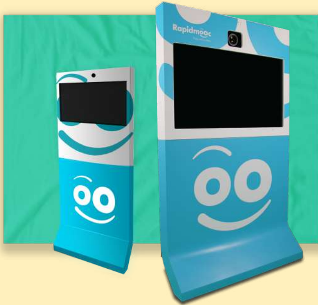
Rapidmooc Studio and Rapidmooc Studio Pro